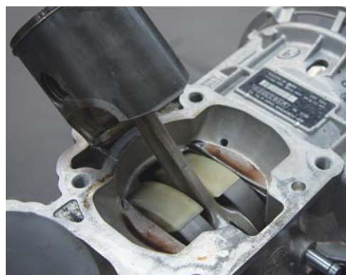
The pistons suffered only minor scuffing.