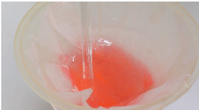
Wax formation in untreated diesel fuel plugs a coffee filter.