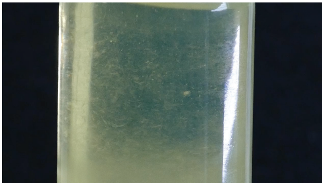
Wax crystals in untreated diesel fuel. The wax crystals will eventually fall out of solution and plug the fuel filter.