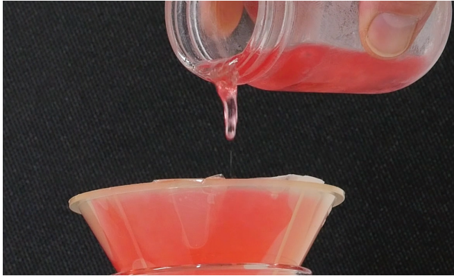
Wax formation in untreated diesel fuel resists pouring.

lowers the cold filter-plugging point (CFPP) by up to 40°F (22°C) in ULSD.