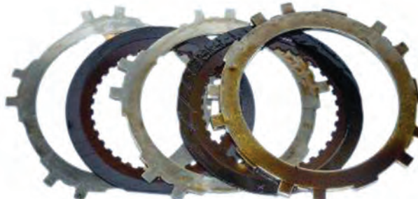
Automatic transmission clutch plates pre-cleanup. Varnish and glazing is heavy on some of the plates.