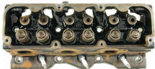
Cylinder head pre-cleanup. Note the sludge deposits on and around the valve springs and push rod openings.