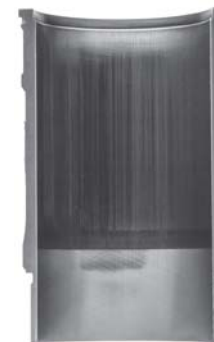
Severely Scuffed Liner