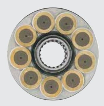
YELLOW METAL PISTON SHOES

After 608 hours of strenuous pump testing in a Parker Hannifin (Denison) T6H20C Hybrid pump, the piston shoes demonstrated only moderate polishing and trace, random scratches, proving AMSOIL Synthetic Multi-Viscosity Hydraulic Oil excels at protecting yellow metals. The vane pump cam ring exhibited only light polishing and trace scratching, further confirming the excellent wear protection provided by the oil.