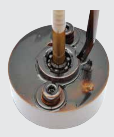
LEADING CONVENTIONAL HYDRAULIC FLUID (ISO 46)