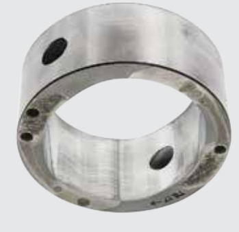
VANE PUMP CAM RING