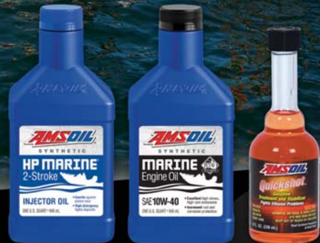
SYNTHETIC 2-STROKE OIL